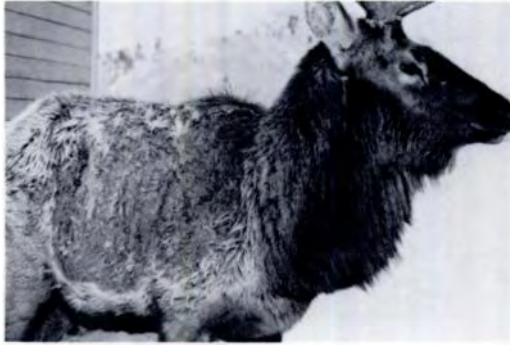
FIGURE 1. Adult male elk from the National Elk Refuge, Wyoming, with severe psoroptic scabies.

ent on elk with scabies, but lice were present on five other elk and abundant on two calves (Table 1).