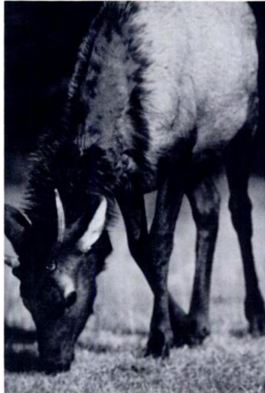
FIGURE 3. Yearling male elk from Banff National Park, Alberta, with winter tick-induced alopecia.

Mites of the genus Psoroptes are pests of wildlife and domestic animals in many countries (Lange et al., 1980; Welch and Bunch, 1983; Kirkwood, 1986; Cole and Guillot, 1987). The effects of Psoroptes sp. on elk have not been studied as extensively as those of Psoroptes ovis on domestic cattle (Stromberg and Fisher, 1986; Stromberg et al., 1986; Cole and Guillot, 1987; Stromberg and Guillot, 1989), but pathogenic events are probably similar. Severity of clinical disease in cattle is determined by mite density (Stromberg et al., 1986). Adult female mites lay many eggs in a short time and in cattle at least, mite infestation can result in severe exudative dermatitis and death 7 and 9 wk after infestation, respectively (Cole and Guillot, 1987). Domestic cattle with >15% of the skin surface manifesting dermatitis have reduced daily weight gains while those with 40% or more of the skin involved may die